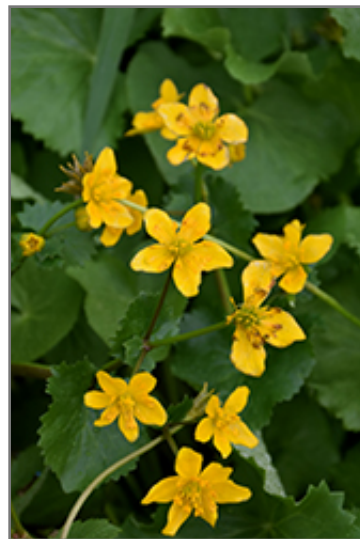
Marsh Marigold flowers