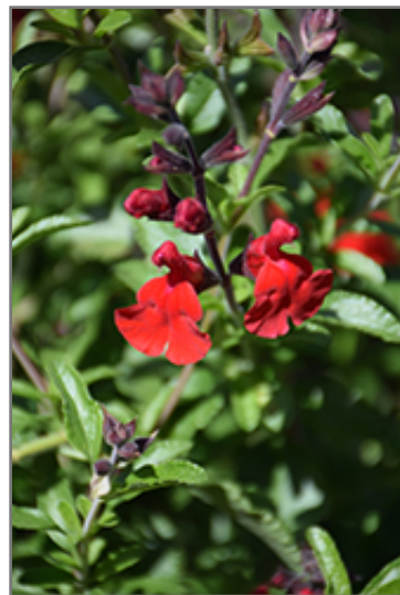
Radio Red Autumn Sage flowers