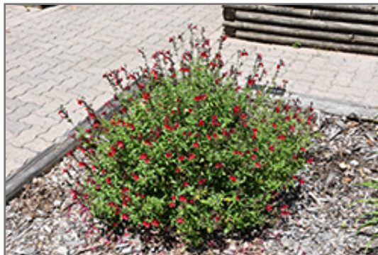
Radio Red Autumn Sage in bloom

Radio Red Autumn Sage will grow to be about 14 inches tall at maturity, with a spread of 16 inches. When grown in masses or used as a bedding plant, individual plants should be spaced approximately 12 inches apart. It grows at a medium rate, and under ideal conditions can be expected to live for approximately 5 years. As an evergreen perennial, this plant will typically keep its form and foliage year-round.