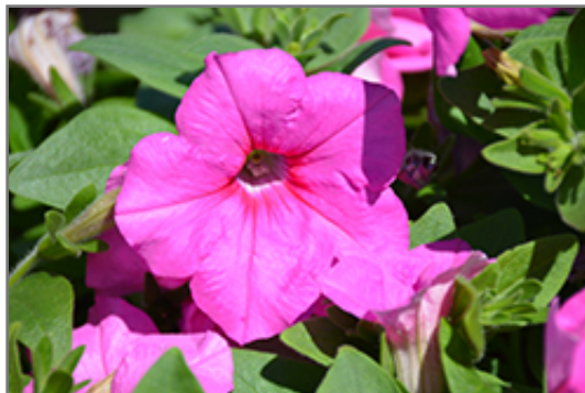
Easy Wave Pink Passion Petunia flowers

Easy Wave Pink Passion Petunia is recommended for the following landscape applications;