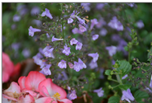
Marvelette Blue Dwarf Calamint flowers