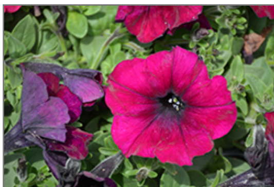
Easy Wave Burgundy Velour Petunia flowers