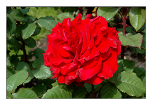
In The Mood Rose flowers