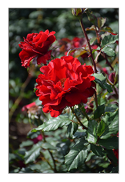
In The Mood Rose flowers