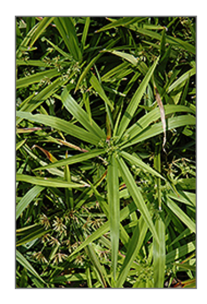
Dwarf Umbrella Plant foliage