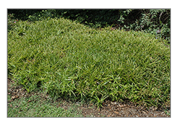
Dwarf Umbrella Plant