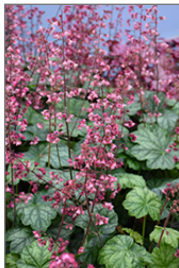
Berry Timeless Coral Bells flowers