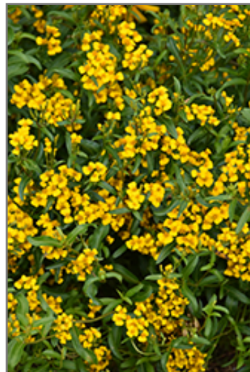
Mexican Tarragon flowers

Mexican Tarragon will grow to be about 30 inches tall at maturity, with a spread of 18 inches. Its foliage tends to remain dense right to the ground, not requiring facer plants in front. Although it's not a true annual, this plant can be expected to behave as an annual in our climate if left outdoors over the winter, usually needing replacement the following year. As such, gardeners should take into consideration that it will perform differently than it would in its native habitat.