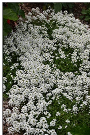
Stream White Sweet Alyssum in bloom