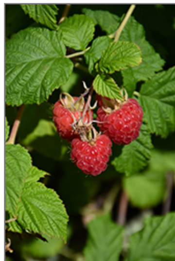
Raspberry Shortcake Raspberry fruit

This is an open multi-stemmed deciduous shrub with an upright spreading habit of growth. Its relatively coarse texture can be used to stand it apart from other landscape plants with finer foliage. This is a high maintenance plant that will require regular care and upkeep. Each spring, cut back all dead and two-year old canes to the ground, leaving only last year's growth standing. It is a good choice for attracting birds to your yard. Gardeners should be aware of the following characteristic(s) that may warrant special consideration;