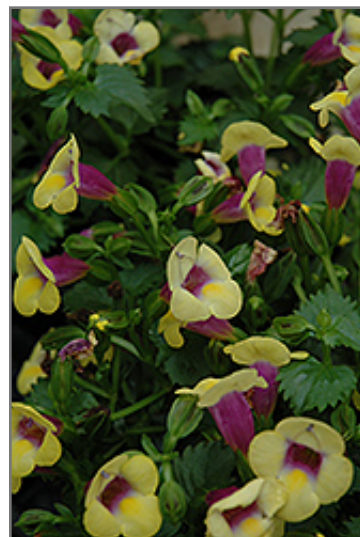
Yellow Moon Torenia flowers

Yellow Moon Torenia is recommended for the following landscape applications;