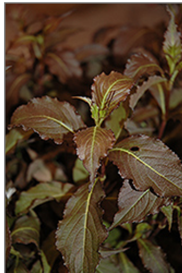
Spilled Wine Weigela foliage

Spilled Wine Weigela makes a fine choice for the outdoor landscape, but it is also well-suited for use in outdoor pots and containers. Because of its height, it is often used as a 'thriller' in the 'spiller-thriller-filler' container combination; plant it near the center of the pot, surrounded by smaller plants and those that spill over the edges. It is even sizeable enough that it can be grown alone in a suitable container. Note that when grown in a container, it may not perform exactly as indicated on the tag - this is to be expected. Also note that when growing plants in outdoor containers and baskets, they may require more frequent waterings than they would in the yard or garden.