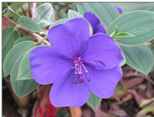
Princess Flower flowers