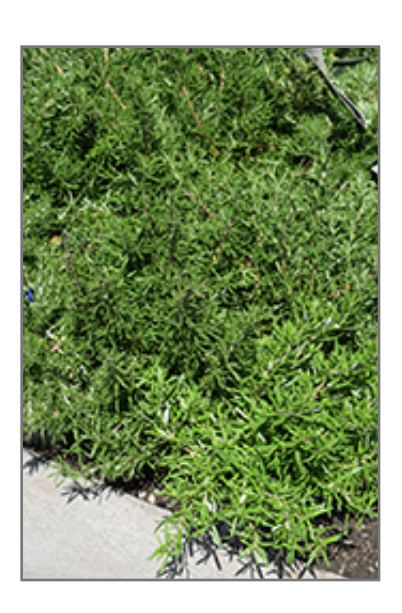
Roman Beauty Rosemary

This plant is quite ornamental as well as edible, and is as much at home in a landscape or flower garden as it is in a designated herb garden. It should only be grown in full sunlight. It prefers dry to average moisture levels with very well-drained soil, and will often die in standing water. It is not particular as to soil type or pH. It is highly tolerant of urban pollution and will even thrive in inner city environments. Consider applying a thick mulch around the root zone in winter to protect it in exposed locations or colder microclimates. This is a selected variety of a species not originally from North America.