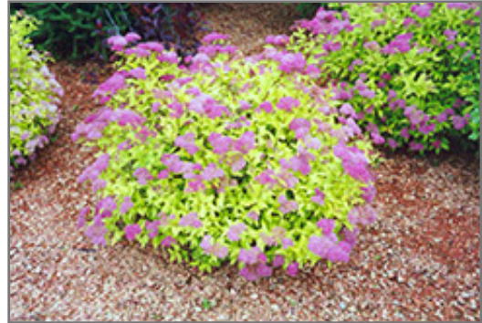
Goldmound Spirea in bloom

This shrub should only be grown in full sunlight. It prefers to grow in average to moist conditions, and shouldn't be allowed to dry out. It is not particular as to soil type or pH. It is highly tolerant of urban pollution and will even thrive in inner city environments. This is a selected variety of a species not originally from North America.