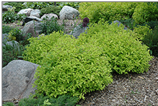
Goldmound Spirea