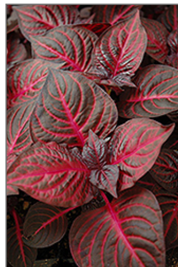
Blazin' Rose Blood Leaf foliage