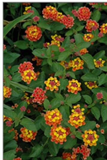
Landmark Citrus Lantana flowers