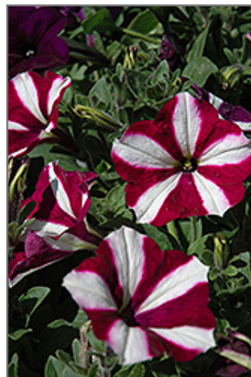
Easy Wave Burgundy Star Petunia flowers

Easy Wave Burgundy Star Petunia is recommended for the following landscape applications;