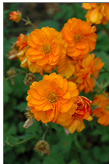
Fire Storm Avens flowers