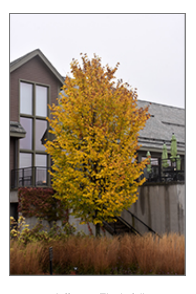
Jefferson Elm in fall