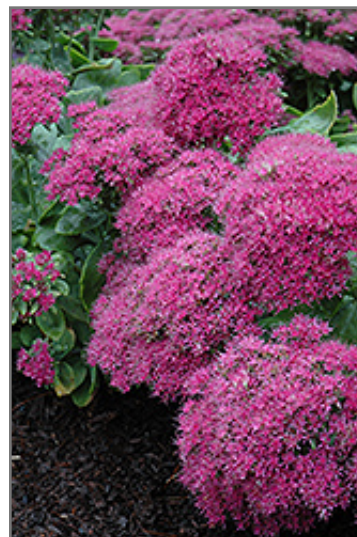
Neon Stonecrop flowers

Neon Stonecrop is recommended for the following landscape applications;