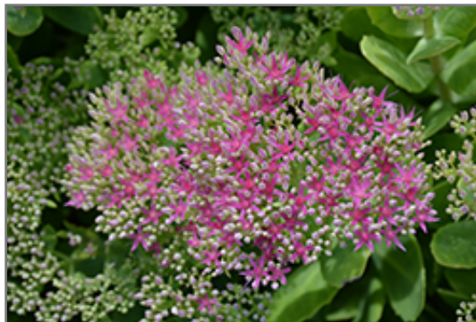
Neon Stonecrop flower buds

Neon Stonecrop is a fine choice for the garden, but it is also a good selection for planting in outdoor pots and containers. With its upright habit of growth, it is best suited for use as a 'thriller' in the 'spiller-thriller-filler' container combination; plant it near the center of the pot, surrounded by smaller plants and those that spill over the edges. Note that when growing plants in outdoor containers and baskets, they may require more frequent waterings than they would in the yard or garden.