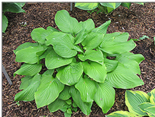
Fried Bananas Hosta