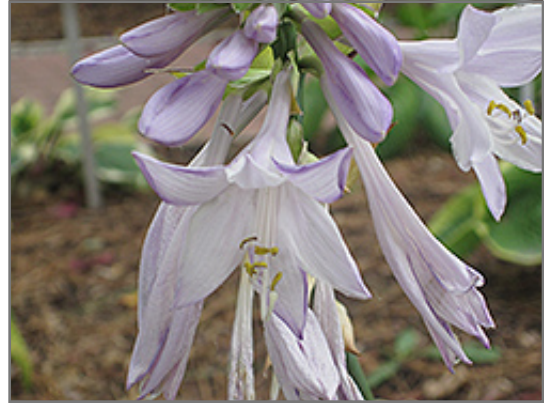
Fried Bananas Hosta flowers

Fried Bananas Hosta will grow to be about 24 inches tall at maturity extending to 3 feet tall with the flowers, with a spread of 4 feet. When grown in masses or used as a bedding plant, individual plants should be spaced approximately 4 feet apart. Its foliage tends to remain dense right to the ground, not requiring facer plants in front. It grows at a fast rate, and under ideal conditions can be expected to live for approximately 10 years. As an herbaceous perennial, this plant will usually die back to the crown each winter, and will regrow from the base each spring. Be careful not to disturb the crown in late winter when it may not be readily seen!