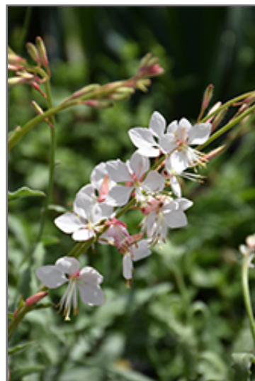
Whirling Butterflies Gaura flowers

Whirling Butterflies Gaura is recommended for the following landscape applications;