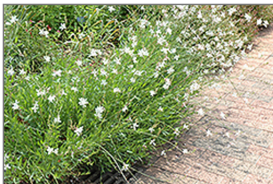
Whirling Butterflies Gaura in bloom