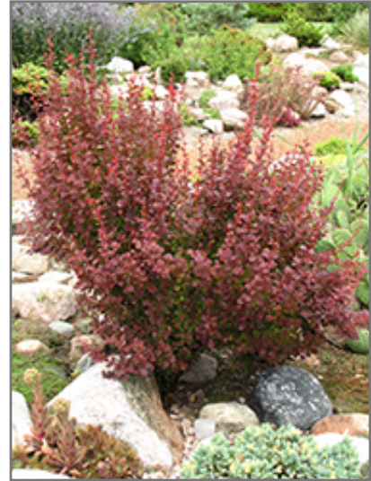
Orange Rocket Japanese Barberry

This shrub does best in full sun to partial shade. It is very adaptable to both dry and moist growing conditions, but will not tolerate any standing water. It is considered to be drought-tolerant, and thus makes an ideal choice for xeriscaping or the moisture-conserving landscape. It is not particular as to soil type or pH, and is able to handle environmental salt. It is highly tolerant of urban pollution and will even thrive in inner city environments. This is a selected variety of a species not originally from North America.