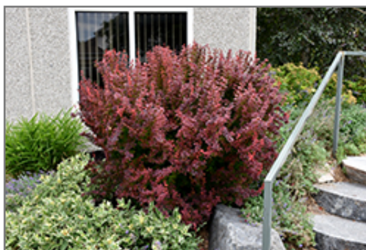
Orange Rocket Japanese Barberry