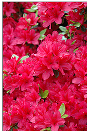
Hino Crimson Azalea flowers