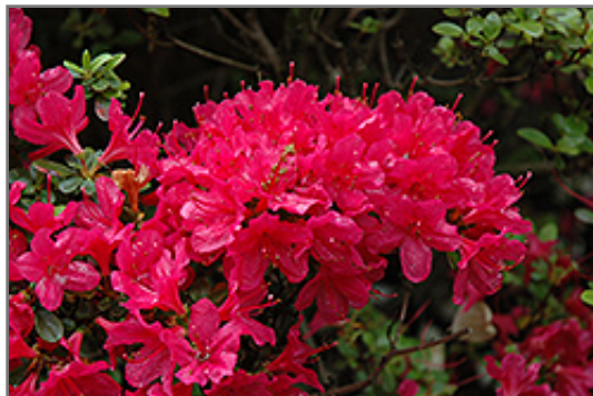
Hino Crimson Azalea flowers

This shrub does best in full sun to partial shade. You may want to keep it away from hot, dry locations that receive direct afternoon sun or which get reflected sunlight, such as against the south side of a white wall. It requires an evenly moist well-drained soil for optimal growth, but will die in standing water. It is very fussy about its soil conditions and must have rich, acidic soils to ensure success, and is subject to chlorosis (yellowing) of the foliage in alkaline soils. It is somewhat tolerant of urban pollution, and will benefit from being planted in a relatively sheltered location. Consider applying a thick mulch around the root zone in winter to protect it in exposed locations or colder microclimates. This particular variety is an interspecific hybrid.