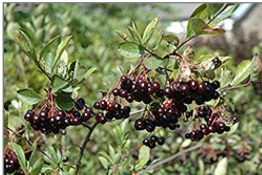
Autumn Magic Black Chokeberry fruit

This shrub should only be grown in full sunlight. It is an amazingly adaptable plant, tolerating both dry conditions and even some standing water. It is not particular as to soil type or pH, and is able to handle environmental salt. It is somewhat tolerant of urban pollution. This is a selection of a native North American species.