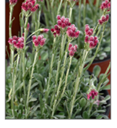
Red Pussytoes flowers