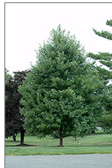
October Glory Red Maple