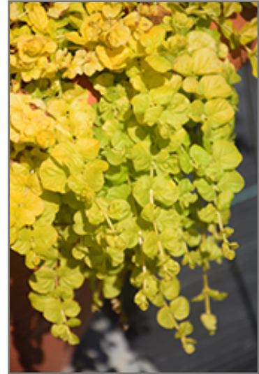
Goldilocks Creeping Jenny foliage

Goldilocks Creeping Jenny is recommended for the following landscape applications;