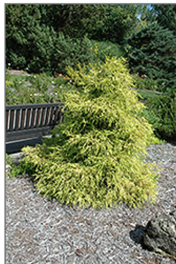
Lemon Thread Falsecypress