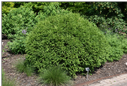
Green Gem Boxwood