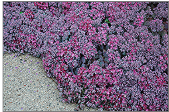
Lidakense Stonecrop in bloom