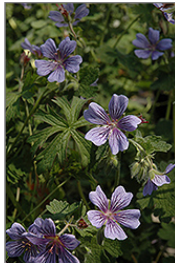
Brookside Cranesbill flowers

Brookside Cranesbill is recommended for the following landscape applications;