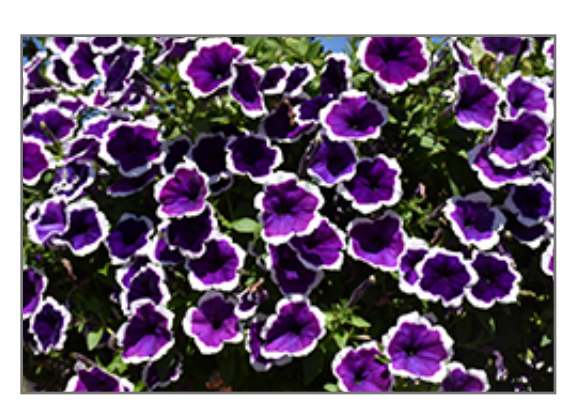
Headliner Dark Violet Picotee Petunia flowers