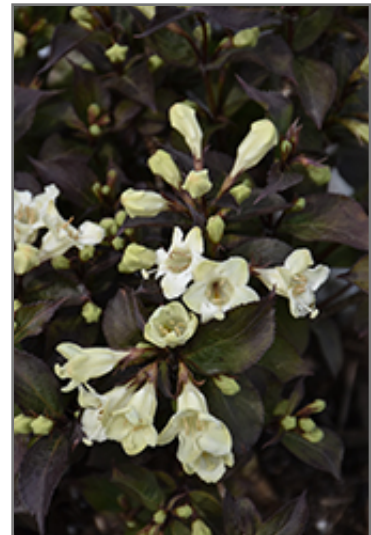
Wine & Spirits Weigela flowers