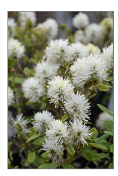
Legend Of The Small Fothergilla flowers