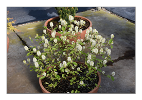
Legend Of The Small Fothergilla in bloom