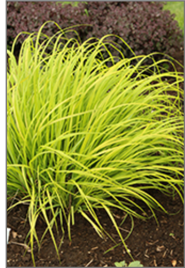
Prairie Winds Lemon Squeeze Fountain Grass

Prairie Winds Lemon Squeeze Fountain Grass is recommended for the following landscape applications;