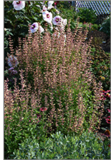
Meant To Bee Queen Nectarine Anise Hyssop in bloom

Meant To Bee Queen Nectarine Anise Hyssop is a fine choice for the garden, but it is also a good selection for planting in outdoor pots and containers. With its upright habit of growth, it is best suited for use as a 'thriller' in the 'spiller-thriller-filler' container combination; plant it near the center of the pot, surrounded by smaller plants and those that spill over the edges. It is even sizeable enough that it can be grown alone in a suitable container. Note that when growing plants in outdoor containers and baskets, they may require more frequent waterings than they would in the yard or garden.