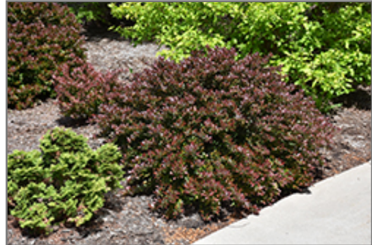
Concorde Japanese Barberry

Concorde Japanese Barberry is recommended for the following landscape applications;