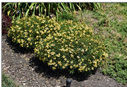
Sizzle And Spice Sassy Saffron Tickseed in bloom