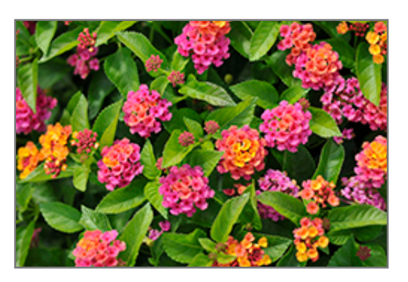
Bloomify Rose Lantana flowers

Bloomify Rose Lantana is recommended for the following landscape applications;