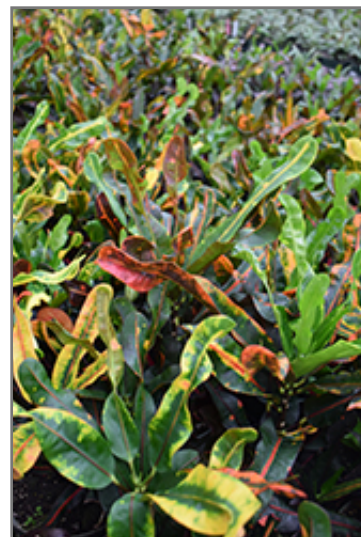
Mammy Croton in full

When grown indoors, Mammy Croton can be expected to grow to be about 3 feet tall at maturity, with a spread of 4 feet. It grows at a medium rate, and under ideal conditions can be expected to live for approximately 10 years. This houseplant will do well in a location that gets either direct or indirect sunlight, although it will usually require a more brightly-lit environment than what artificial indoor lighting alone can provide. It does best in average to evenly moist soil, but will not tolerate standing water. The surface of the soil shouldn't be allowed to dry out completely, and so you should expect to water this plant once and possibly even twice each week. Be aware that your particular watering schedule may vary depending on its location in the room, the pot size, plant size and other conditions; if in doubt, ask one of our experts in the store for advice. It is not particular as to soil pH, but grows best in rich soil. Contact the store for specific recommendations on pre-mixed potting soil for this plant. Be warned that parts of this plant are known to be toxic to humans and animals, so special care should be exercised if growing it around children and pets.