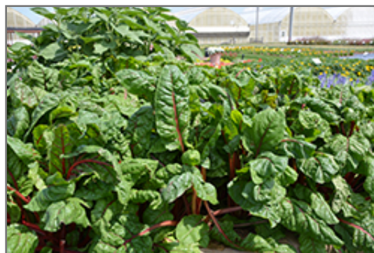
Ruby Red Swiss Chard