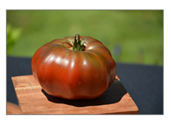
Black Krim Tomato fruit

Black Krim Tomato will grow to be about 4 feet tall at maturity, with a spread of 18 inches. When planted in rows, individual plants should be spaced approximately 24 inches apart. Because of its vigorous growth habit, it may require staking or supplemental support. This fast-growing vegetable plant is an annual, which means that it will grow for one season in your garden and then die after producing a crop.