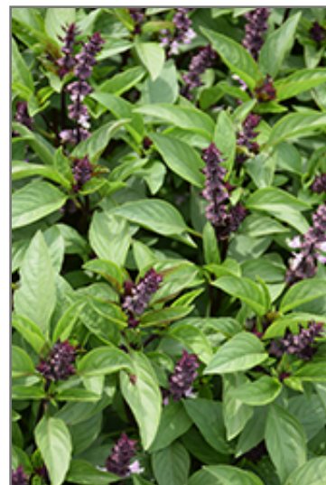
Sweet Basil flowers

Sweet Basil is a good choice for the edible garden, but it is also well-suited for use in outdoor pots and containers. It is often used as a 'filler' in the 'spiller-thriller-filler' container combination, providing the canvas against which the larger thriller plants stand out. Note that when growing plants in outdoor containers and baskets, they may require more frequent waterings than they would in the yard or garden.