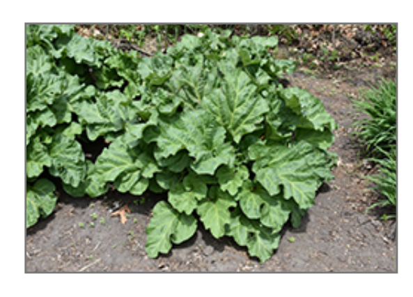
Crimson Red Rhubarb

Crimson Red Rhubarb is primarily valued in the landscape or garden for its pronouncedly upright and towering form. It features bold spikes of creamy white flowers rising above the foliage from late spring to early summer. Its attractive large crinkled lobed leaves emerge chartreuse in spring, turning dark green in color throughout the season. The crimson stems are very colorful and add to the overall interest of the plant.