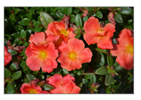
Pazzaz Orange Flare Portulaca flowers

Pazzaz Orange Flare Portulaca is recommended for the following landscape applications;