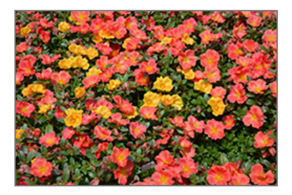
Pazzaz Orange Flare Portulaca in bloom