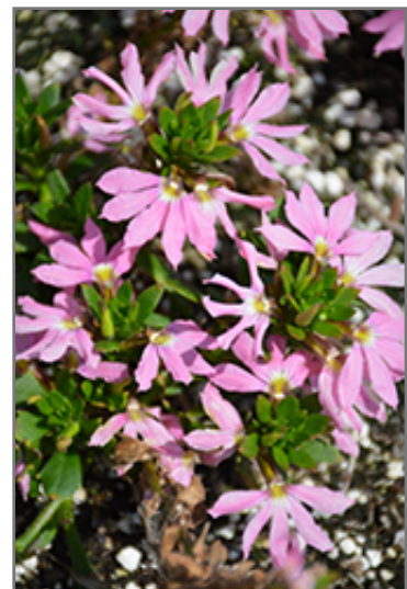
Surdiva Classic Pink Fan Flower flowers