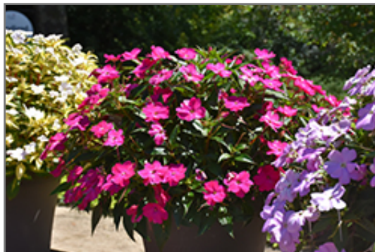
SunPatiens Vigorous Rose Pink New Guinea Impatiens in bloom

SunPatiens Vigorous Rose Pink New Guinea Impatiens is a fine choice for the garden, but it is also a good selection for planting in outdoor containers and hanging baskets. Because of its height, it is often used as a 'thriller' in the 'spiller-thriller-filler' container combination; plant it near the center of the pot, surrounded by smaller plants and those that spill over the edges. It is even sizeable enough that it can be grown alone in a suitable container. Note that when growing plants in outdoor containers and baskets, they may require more frequent waterings than they would in the yard or garden.