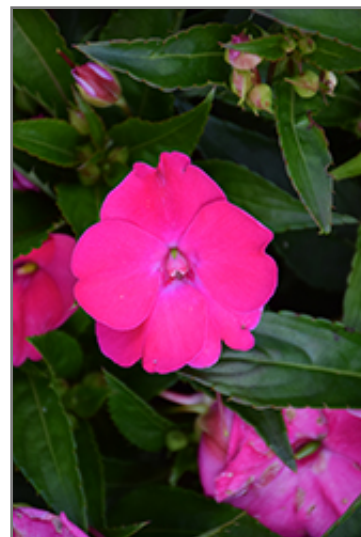
SunPatiens Vigorous Rose Pink New Guinea Impatiens flowers

SunPatiens Vigorous Rose Pink New Guinea Impatiens is recommended for the following landscape applications;